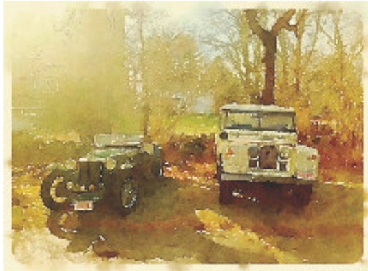
Christmas Day Run 2015