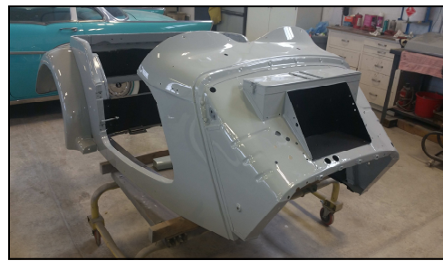
Frank Cronin's TF at the paint shop...looks good frank!